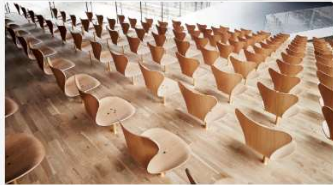
2 Strip Wooden Flooring