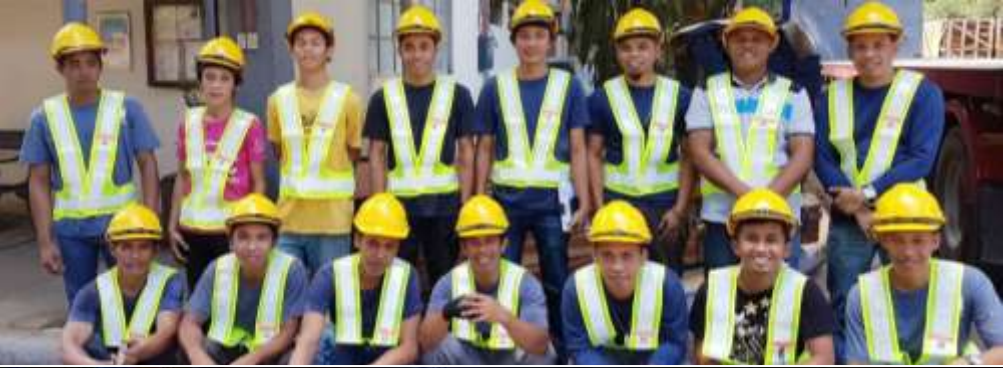
Basketball project in Tacloban, Philippines - 2018