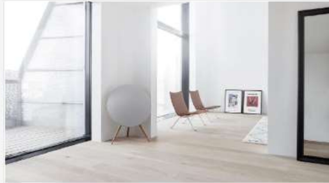
Plank Hardwood Flooring